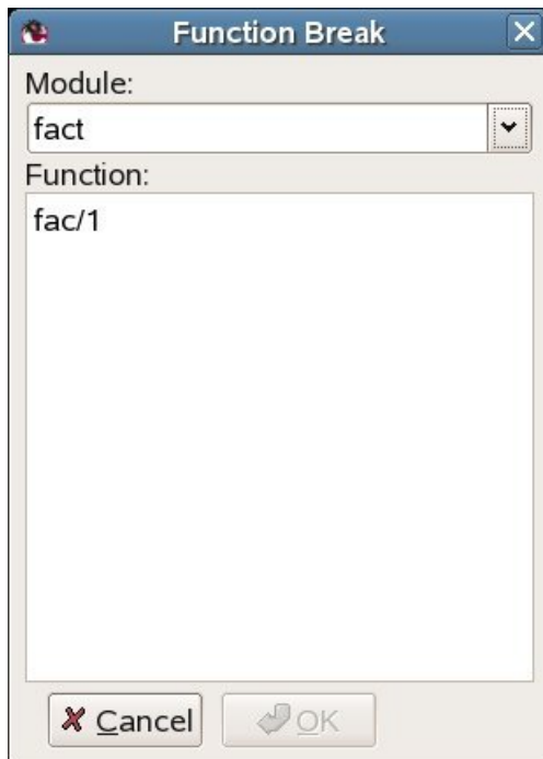
Figure 1.3: The Function Break Dialog Window.

A function breakpoint is a set of line breakpoints, one at the first line of each clause in the given function.